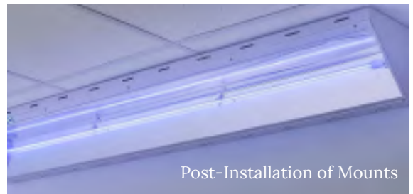
Post-Installation of Mounts