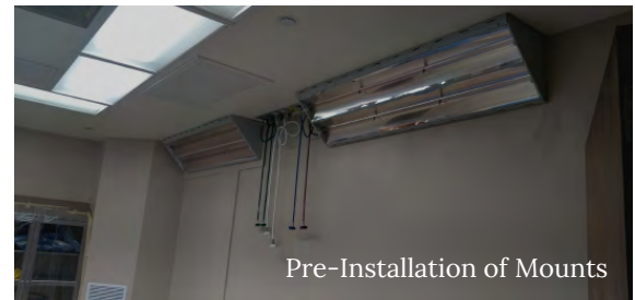
Pre-Installation of Mounts